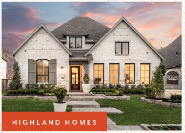
HIGHLAND HOMES 281-517-9847 From the mid $400's | 2,200 - 3,100 sf