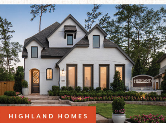
HIGHLAND HOMES 281-517-9848 From the low $300's | 1,500 - 2,400 sf