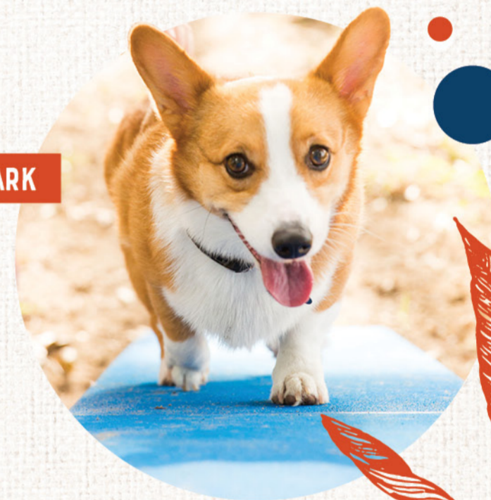
FRISKY BISCUIT DOG PARK

Picnic Park features a harvest table, hammocks, open lawn & musical play for the kids!