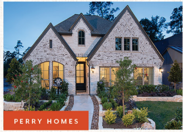
PERRY HOMES 346-227-7720 From the high $300's | 1,900 - 3,300 sf