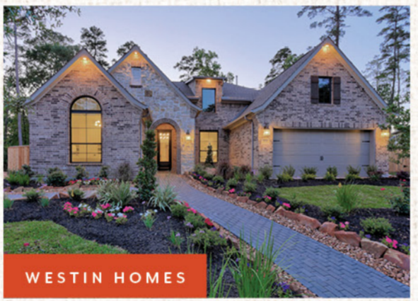
WESTIN HOMES 281-758-8561 From the mid $500's | 2,800 - 3,800 sf