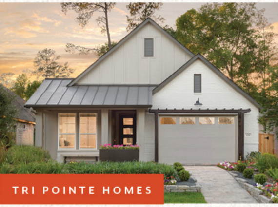
TRI POINTE HOMES 281-675-3345 From the low $400's | 1,800 - 2,600 sf