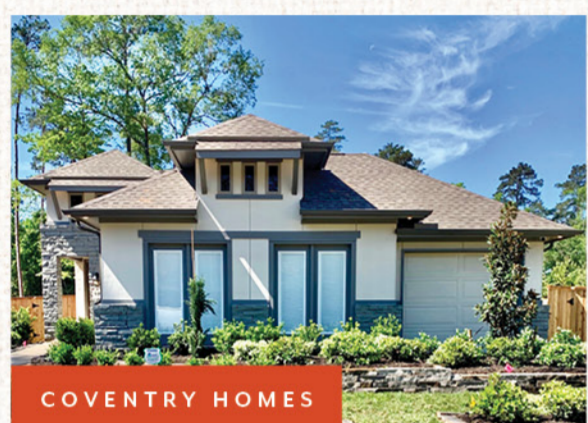
COVENTRY HOMES 713-568-4299 From the low $300's | 1,400 - 2,400 sf

With our new builders, models and designs, you're bound to find the home of your dreams!