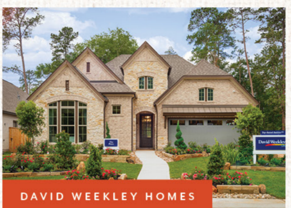
DAVID WEEKLEY HOMES 281-249-7753 From the high $300's | 2,200 - 3,300 sf