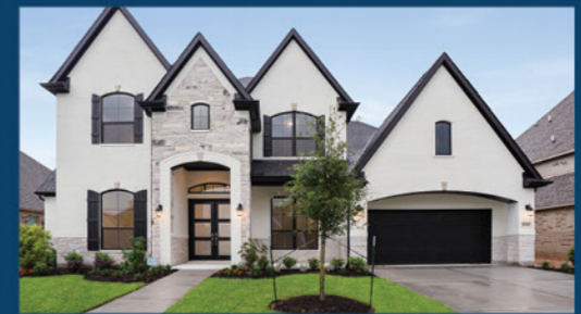
J. PATRICK HOMES From the $750s 3,400+ sf