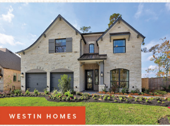
WESTIN HOMES 281-758-8561 From the low $500's | 2,700 - 3,400 sf