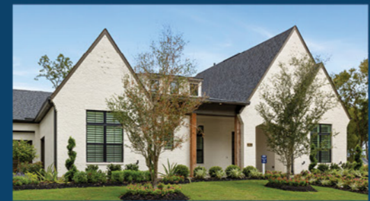
JAMESTOWN ESTATE HOMES From the $800s 3,400+ sf