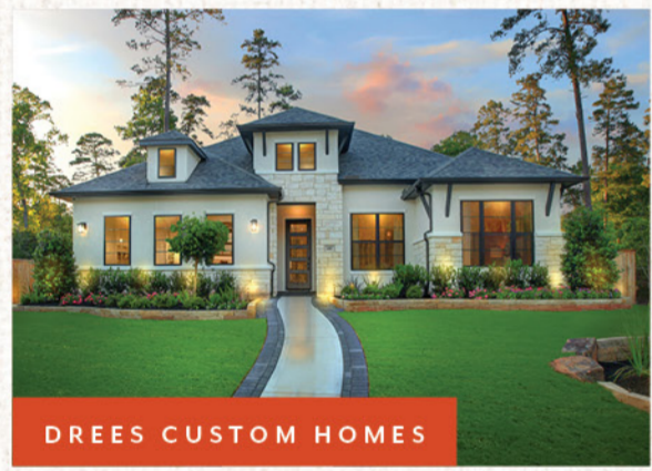
DREES CUSTOM HOMES 281-612-5622 From the high $400's | 2,400 - 3,700 sf