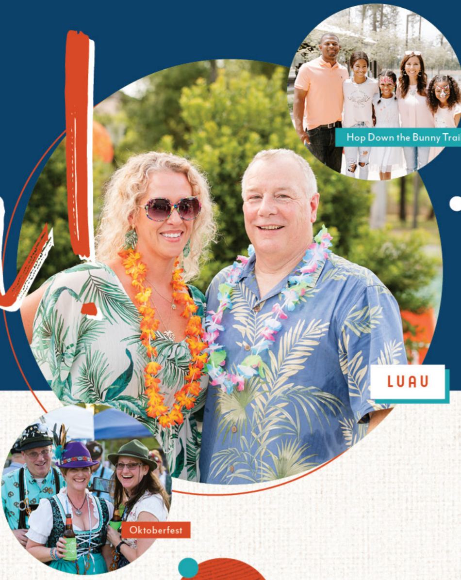
Hop Down the Bunny Trail